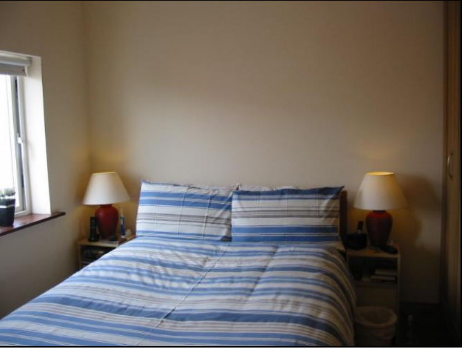
Bedroom 2: 4.12m x 2.58m Pine flooring. Fitted wardrobe.